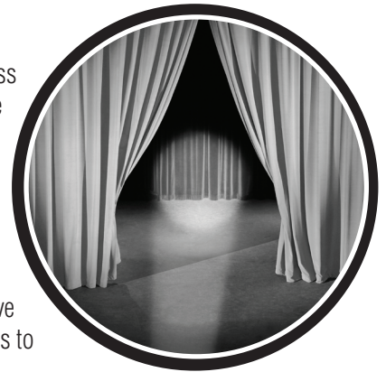
The Cherry Creek Theatre

For membership information and more detail, please visit www.cherrycreektheatre.org which will be available by the end of September.